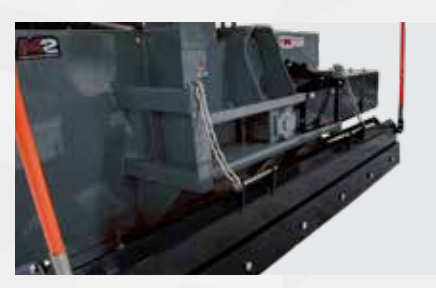
Back Drag (Opt)

Select Blowers come equipped with adjustable skid shoes extending the life of the cutting edge and helping to protect surfaces from damage commonly associated with snow removal.