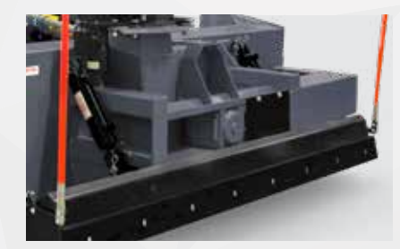
Back Drag Hyd (Opt)

Pull Type blowers are equipped with back drags and come standard with manual chain adjustment.